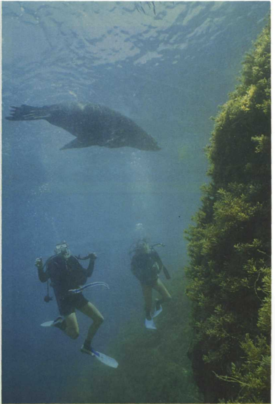
Opposite page: Although Club Med Sonora Bay is a dedicated dive resort, it offers a variety of other sporting activities, entertainment, relaxation, food and friends. Above/right: Divers play with rambunctious sea lions. Clockwise from below: The diving provides ample macro photography opportunities; three buffetstyle, incredibly varied meals are served daily; Club Med also offers open water certifications; one of the club's new boats— Nomad .